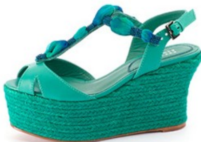
Edmundo Castillo SS12 Rope platform heels