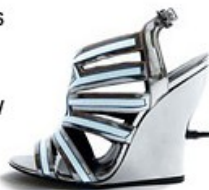
Edmundo Castillo Using electroluminescent materials via L.E.D.